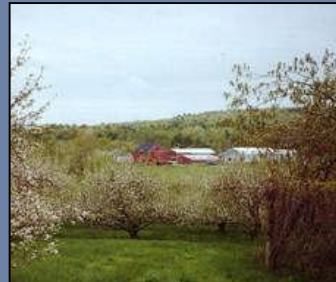
Hiatt Farm, Dresden on the Kennebec River and Lakeside Orchards, Manchester were conserved with help from the LMF program.

In addition to supporting the LMF program, Question 3 will direct $1.75 million into the Working Waterfront Pilot Project, an effort that permanently protects coastal parcels important to Maine’s commercial fishing industry. The bond will also direct $500,000 to Maine’s State Park system. LMF provides funding towards land acquisition to state agencies as well as to municipalities and land trusts with certain provisions. For more information on the program visit the Land for