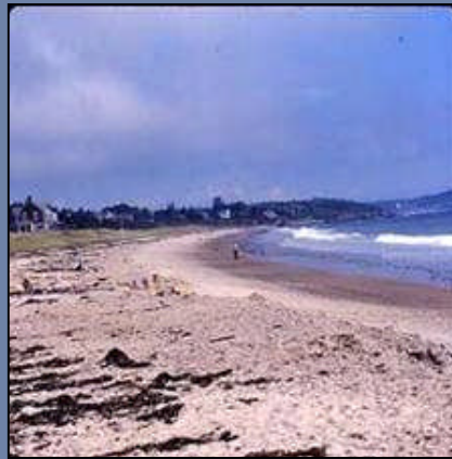
Scarborough Beach, Scarborough was protected with help from the LMF

The outcome of the November 2 nd statewide referendum Question #3 is that Maine voters overwhelmingly approved (Yes: 59%- No: 41%), a $9.75 million bond issue that includes important funding for the Land for Maine's Future Program. The Land for Maine's Future Board and its program, which over a period of twenty-three years has been the State of Maine's primary mechanism for funding acquisition of public lands and also been at the heart of Maine's public efforts to conserve the best Maine has to offer. This award-winning program has protected more than 500,000 acres (approximately 2/3 in conservation easement and 1/3 fee simple), which include mountain summits, river shoreline, lakes, ponds, coastal islands, coastal beaches, forest, grasslands, lands, unique natural state; 158 miles of from abandoned and regional parks the farmlands of these special places Working with helped acquire Maine's heritage public. This year that Maine voters measures.